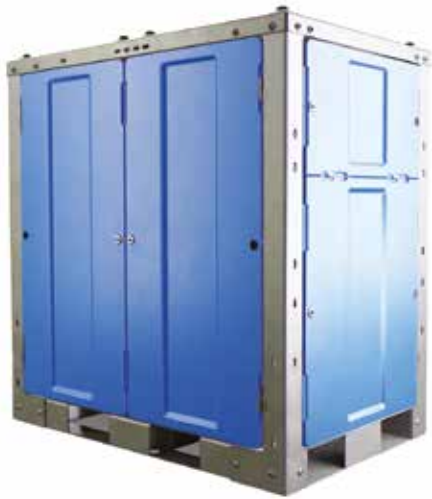
Vacuum Unit 80 x 120 x 130 cm