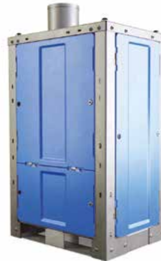
Transfer Tank Unit 60 x 80 x 130 cm