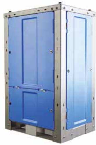
Catcher Unit 60 x 80 x 130 cm