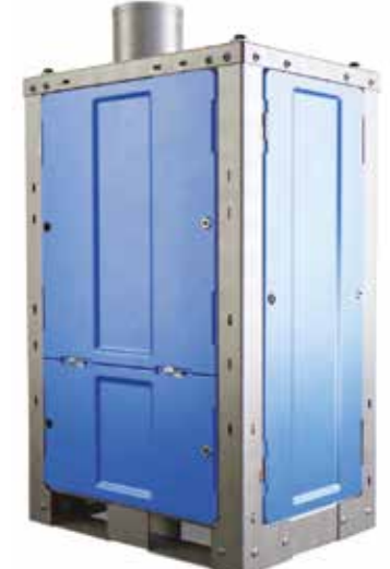
Flow Control Unit 60 x 80 x 130 cm

The new JETS™ NOMAD handles the entire infrastructure of water and waste water throughout the event site.