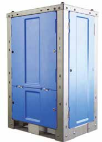
Water Supply Unit 60 x 80 x 130 cm

All this in a system ensuring an even flow at 3,75 L / sec or 1 Gall / sec) by gravity to mains sewer.