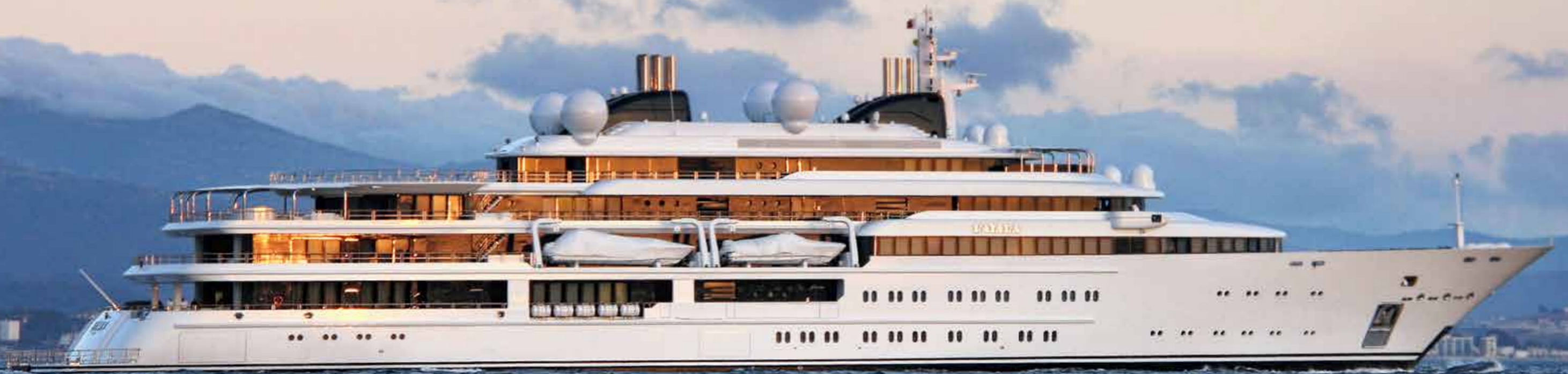
KATARA GIOVANNI/Built by Lürssen Yachts

Before leaving Jets®, all systems are carefully assembled and thoroughly tested to ensure a carefree voyage for both passengers and crew. This is part of the reason why more than 60,000 Vacuumarator® pumps by Jets® are in operation worldwide.