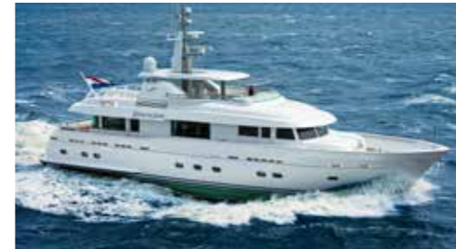
BELLE DE JOUR