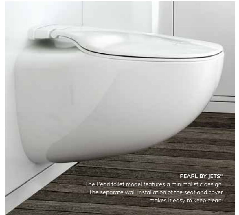
PEARL BY JETS® The Pearl toilet model features a minimalistic design. The separate wall installation of the seat and cover makes it easy to keep clean.