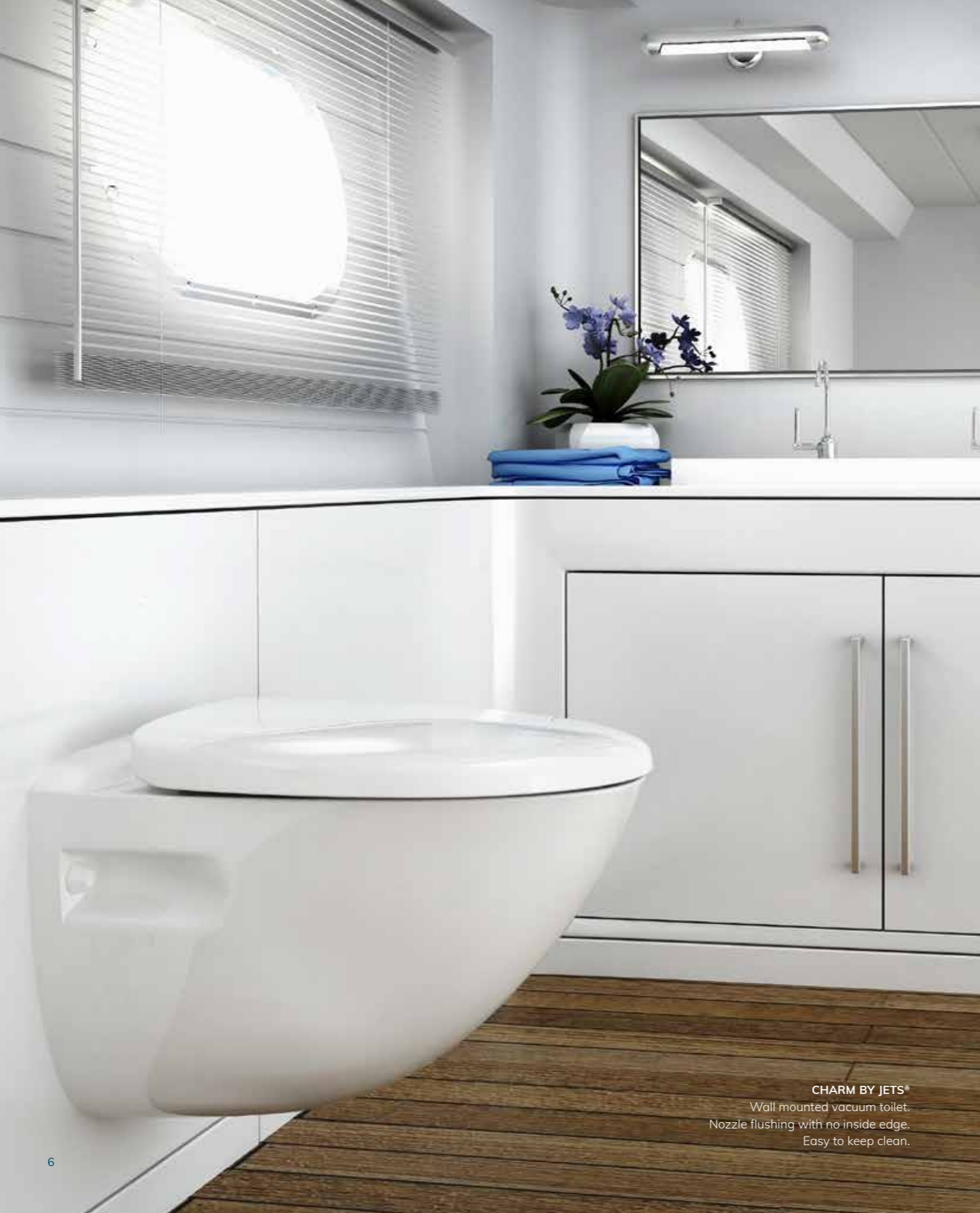
CHARM BY JETS® Wall mounted vacuum toilet. Nozzle flushing with no inside edge. Easy to keep clean.