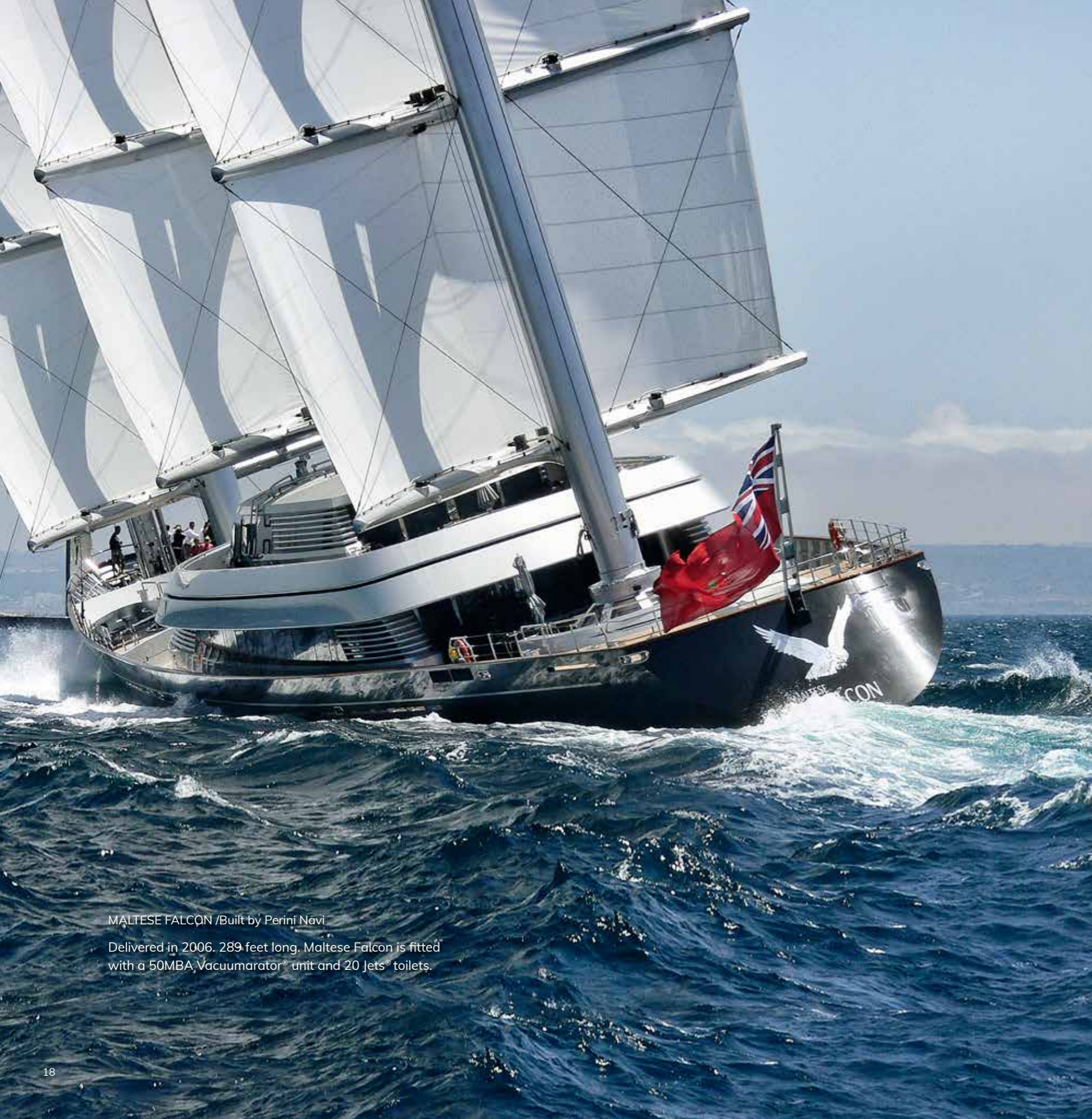
MALTESE FALCON /Built by Perini Navi

Delivered in 2006. 289 feet long. Maltese Falcon is fitted with a 50MBA Vacuumator® unit and 20 Jets® toilets.